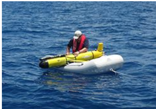
Final adjustments are made to the ballast of the Slocum glider 'Amy'.

Future activity planning for the IMOS Facilities is provided via the IMOS website ( http://imos.org.au/imosactivityplanning.html ). The plans contain details for all the planned deployment/recovery/servicing/sampling etc. activities for the NCRIS 2015 funding period.